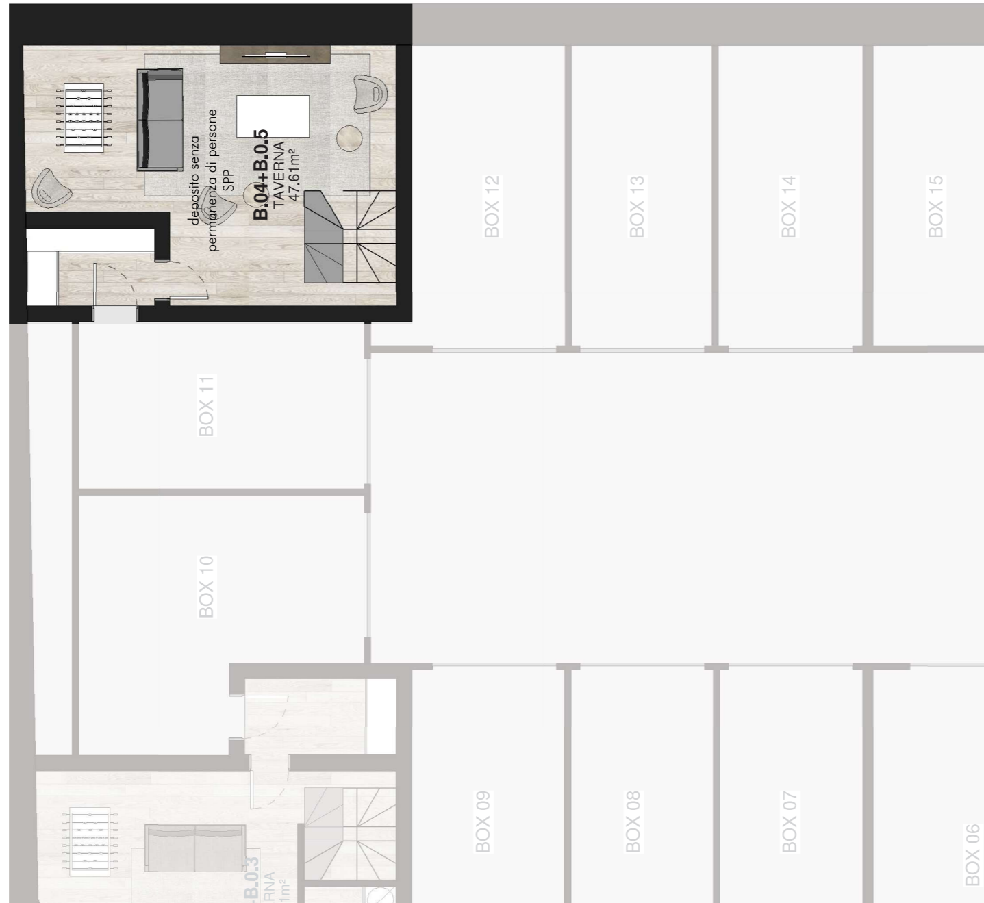
PIANO INTERRATO -1